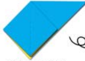
4. Does your paper look like this? If so, turn it over. If no, go back to step 3.