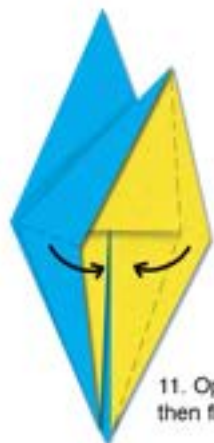
11. Open to boat shape then flatten.