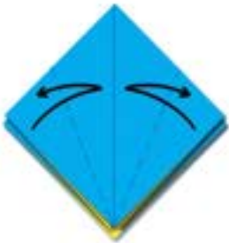
6. Fold sides of top layer to middle, then unfold.