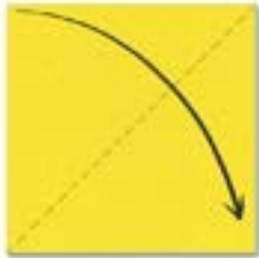
1. Fold your paper in half, diagonally.

Blue represents the front side of the paper. Yellow represents the back. Your paper may look different.