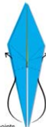
14. Reverse fold the bottom points.