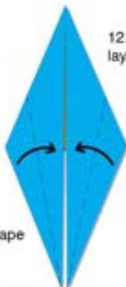
12. Fold sides of top layer to middle.