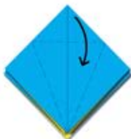
7. Fold top down to side creases, then lift top layer upward.