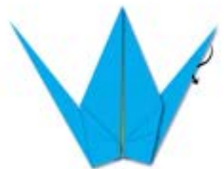
15. Reverse fold one point.