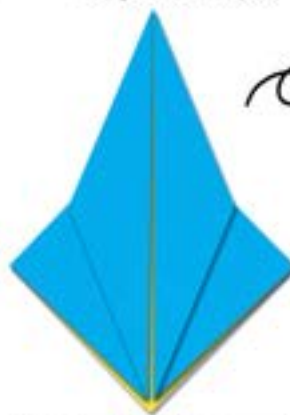
9. Flatten boat shape inward.