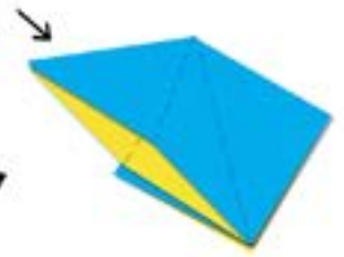
5. Repeat fold on this side.