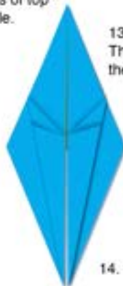
13. Does it look like this? Then turn over and repeat the folds in step 12.