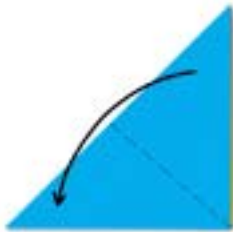
2. Fold in half again.