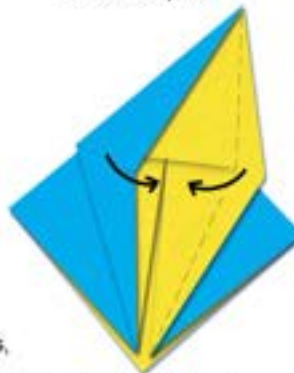
8. Create a boat-like shape by folding sides inward.